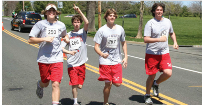
Bernards High lacrosse players run the 5K as a team.