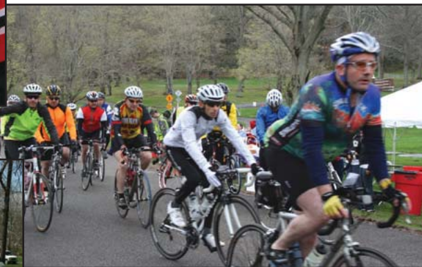
Cyclists take off.