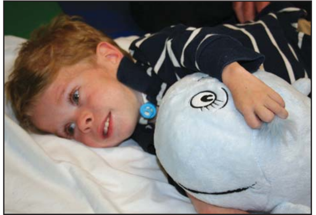
Working on bilateral skills by hugging the whale.