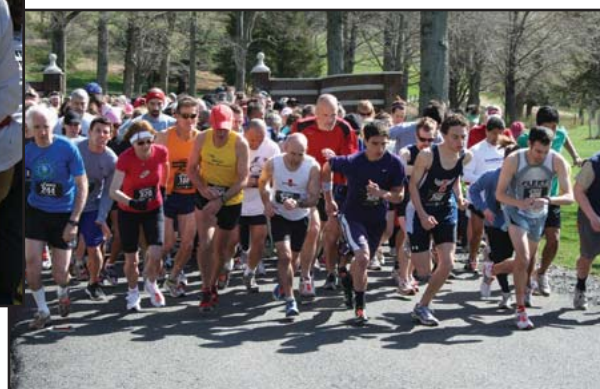
Start of the 5K race.