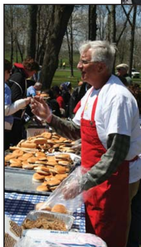
Members of the Bernardsville Rotary grilled hamburgers and hot dogs at the picnic.