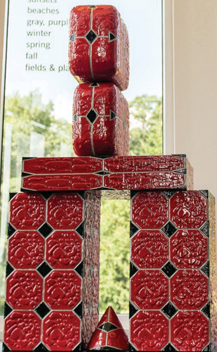
"Nightlight" by Chet Cheesman

sunshine the blue sky sunsets beaches gray, purple winter spring fall fields & pla