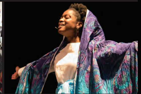
Exhibit Opening | Stage Performance | Reception