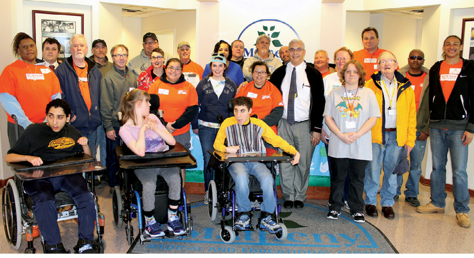
Home Depot employees, Matheny staff and students gathered in the front lobby after the work and tour were completed.