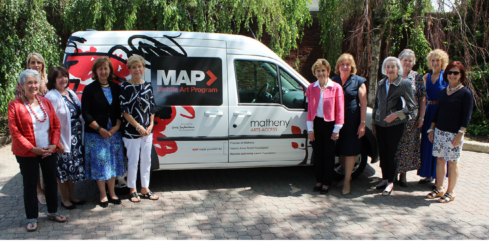
Friends Board members gather around the Mobile Art Program van, which was funded in large part by the Friends of Matheny