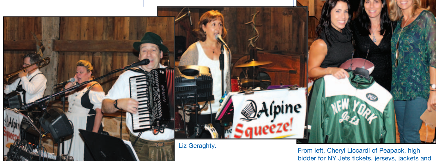
Music was provided by Alpine Squeeze.

contributions to Matheny by buying raffle tickets, bidding in the silent auction and purchasing special Community Connections packages that help fund activities for Matheny's students and patients in the community such as the previously-mentioned camping trips, as well as attendance at concerts and plays and the opportunity to dine out at restaurants.