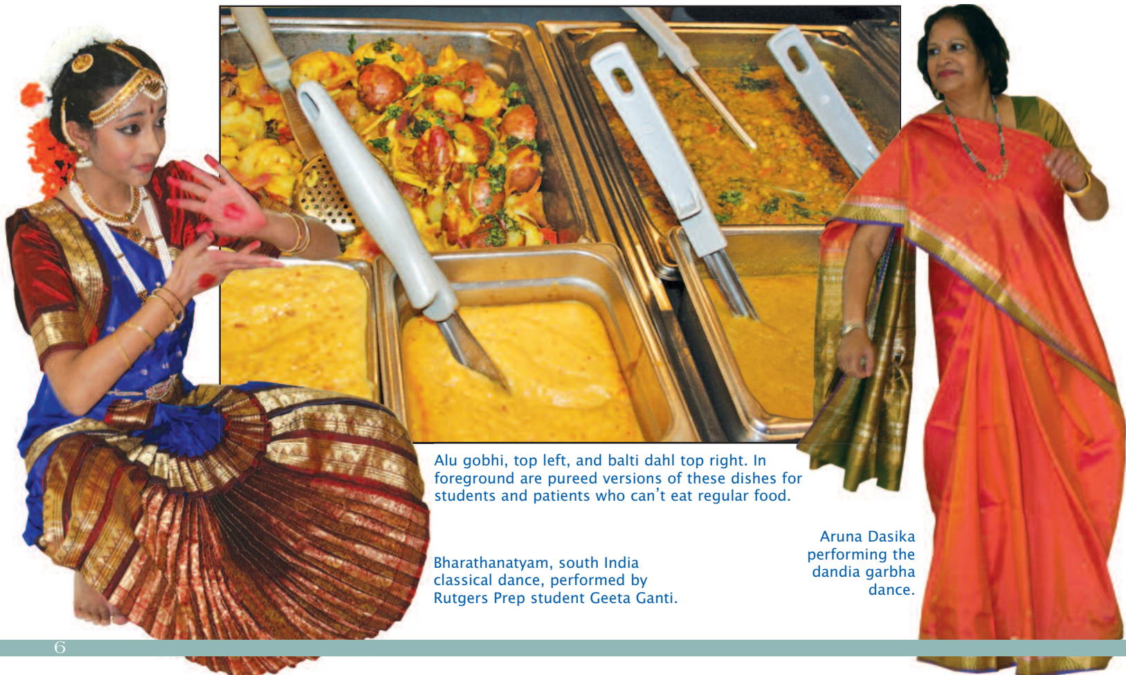
Alu gobhi, top left, and balti dahl top right. In foreground are pureed versions of these dishes for students and patients who can’t eat regular food.