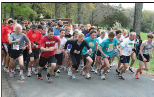
Start of the 5K run.

Sponsorships, registration fees and pledges from Miles for Matheny netted $110,000 to help support the Matheny Center of Medicine and Dentistry, which provides medical, dental and therapy care to Matheny inpatients and people with disabilities in the community. Title sponsor for the fifth consecutive year was sanofi-aventis, one of the world's leading pharmaceutical companies whose U.S. corporate headquarters is in Bridgewater, NJ.