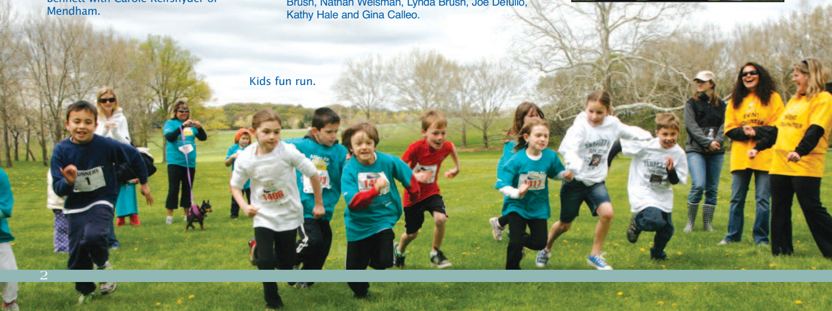
Kids fun run.