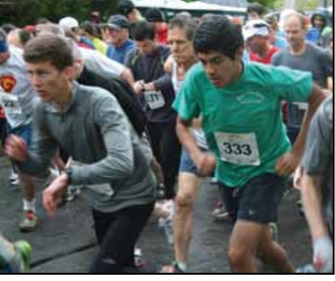
5K runners take off.

Cyclists rest before heading out for 50 miles.